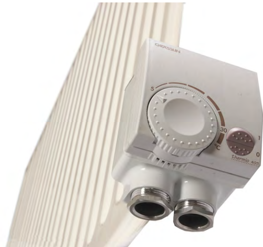
Optional built-up thermostat (For 230 VAC PR suitable only)

Sinus Jevi electric panel radiators are filled with an environment-friendly mineral oil which is heated by means of a heating element. This element is switched off by the safety thermostat when a certain temperature is reached causing the oil to cool down slowly.